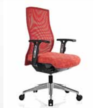
STING RED MESH